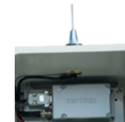
External Antenna with Surge Arrester